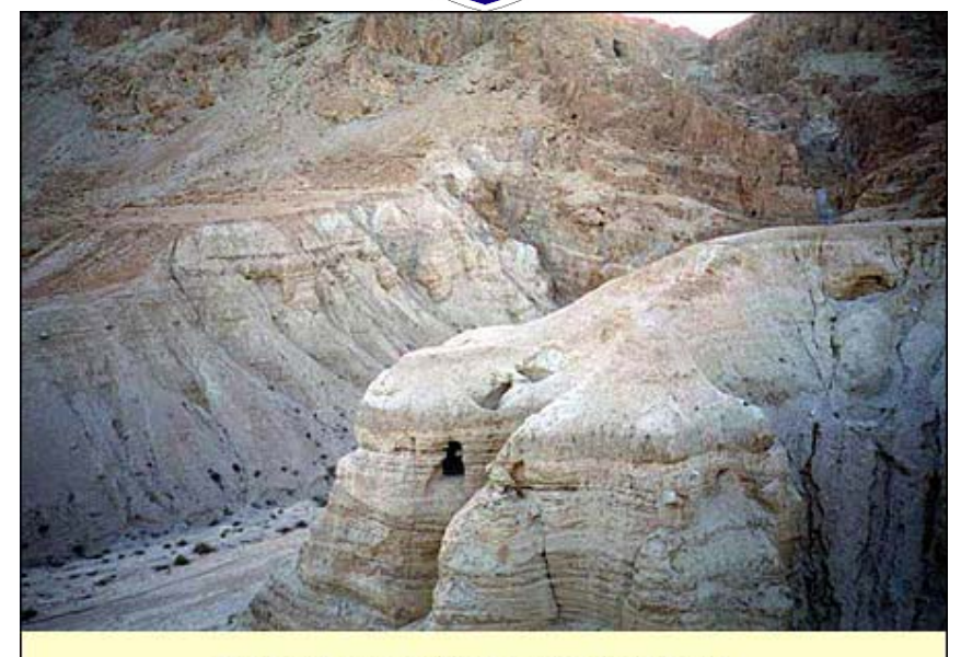
The fourth cave in which scrolls were found (some 15,000 fragments!)