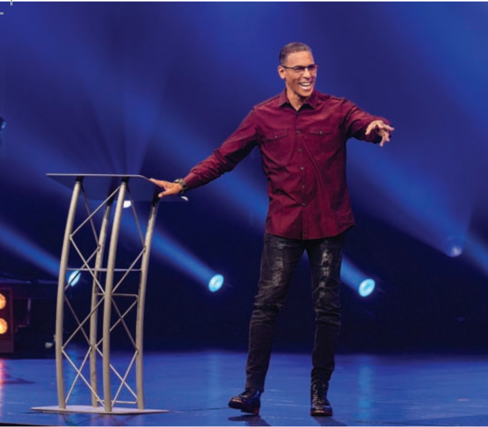
SENIOR PASTOR, ROCK CHURCH