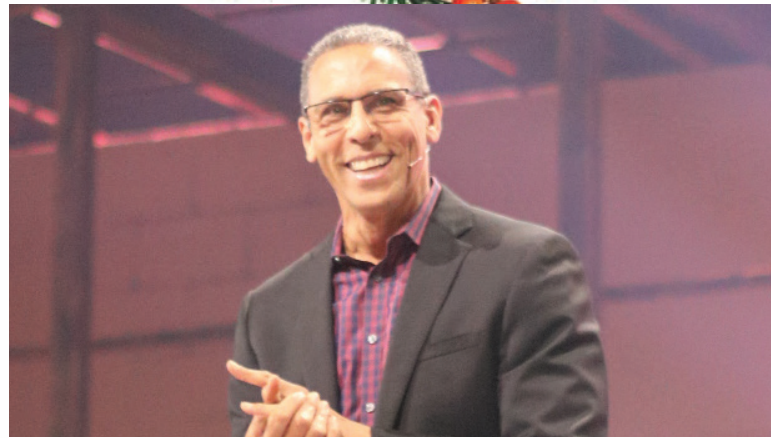
SENIOR PASTOR, ROCK CHURCH