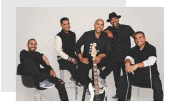
MARCH 24 I 6PM I POINT LOMA ONLY

TO REGISTER, VISIT SDROCK.COM/XOMARRIAGE AND USE PROMO CODE "XOROCKMEMBER" TO RECEIVE $10 OFF YOUR TICKET!