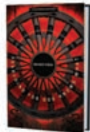
SEARCHING FOR GOD KNOWS WHAT BY: DONALD MILLER