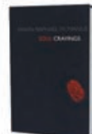
SOUL CRAVINGS BY: ERWIN MCMAUS