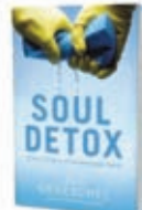
SOUL DETOX BY: CRAIG GROESCHEL