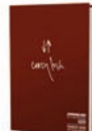
CRAZY LOVE BY: FRANCIS CHAN