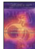
I Don't Want Your Sex for Now