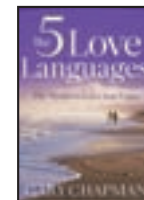
5 Love Languages