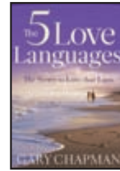
5 Love Languages