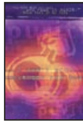
I Don't Want Your Sex for Now